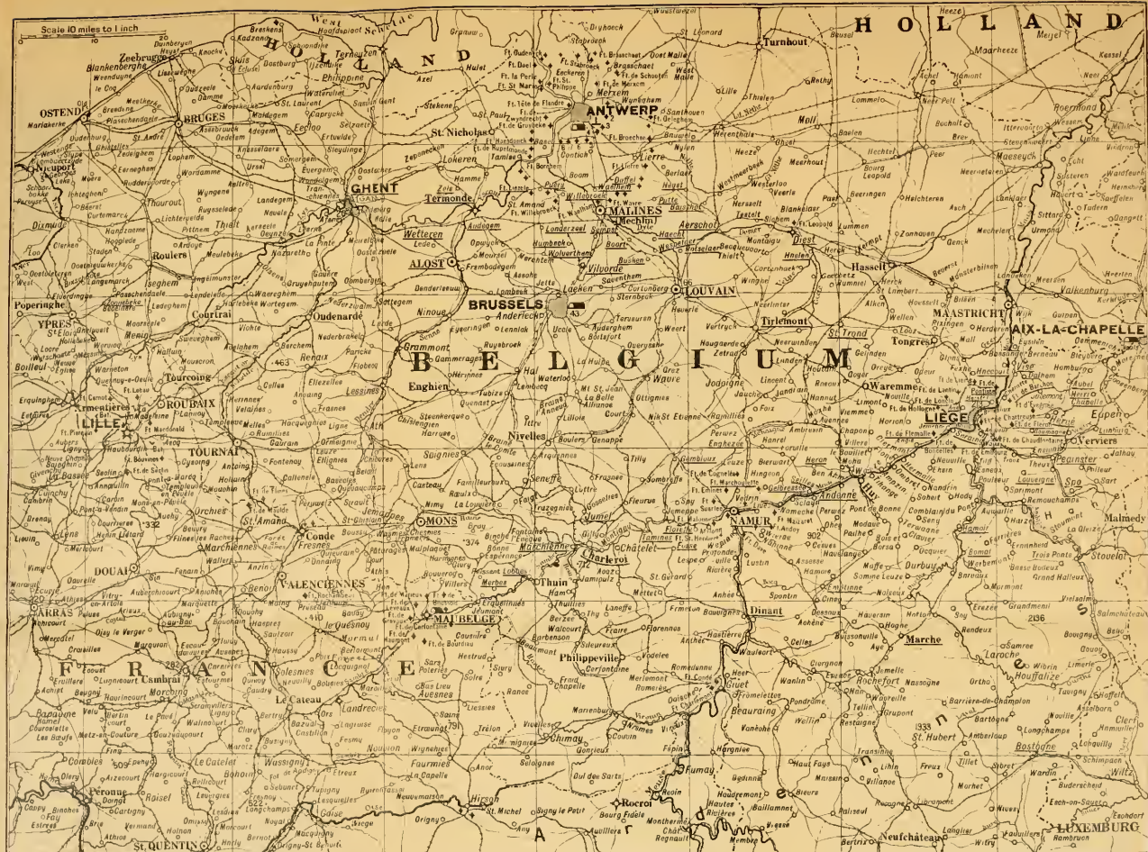
Taken from PHILIP'S LARGE SCALE STRATEGICAL WAR MAP OF EUROPE (Western Area)